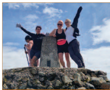
The Three Peaks conquered