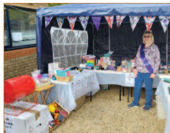
Jubilee Fundraiser Paddons Vets

Three vets completed The Serpents Tail 50km ultramarathon which raised over £1,000. We also had colleagues who climbed Snowdon! Here are some photos from our year of fundraising.