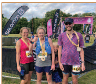
50km trail run St Peters Vets